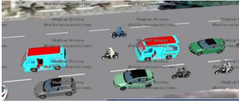
Figure 1. Simulation Before Calibration

errors, and if >10 , it is rejected. The following are the simulation results before calibration: